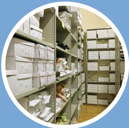
The easily adjustable shelves offer great flexibility to change shelf configuration to match Retail stock requirements