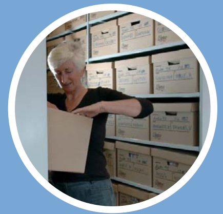
Stormor shelving using Mono inner frames with Duo outer frames offers economy with clean lines.