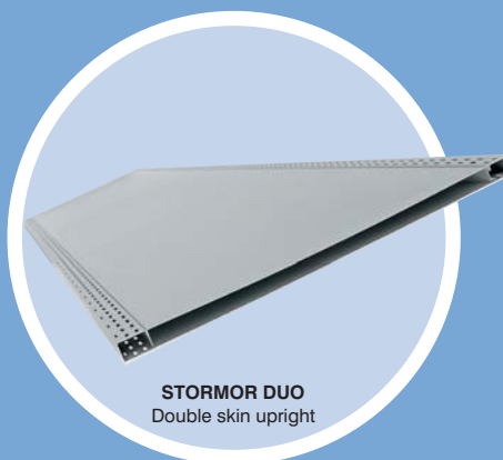
STORMOR DUO Double skin upright