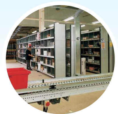
HEAVY DUTY SHELVING