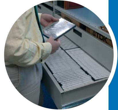
Pull-out drawers offer easy to access storage for CD's and DVD's.