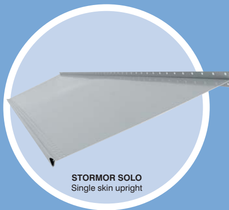
STORMOR SOLO Single skin upright