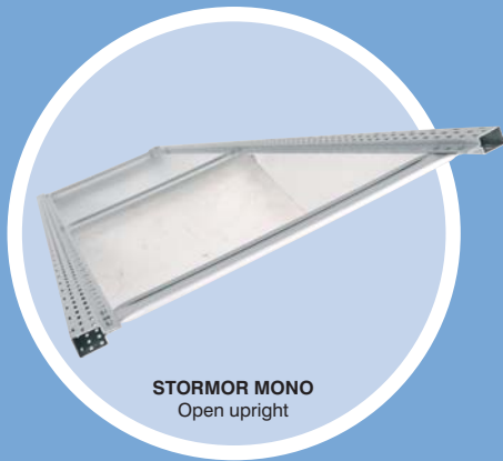
STORMOR MONO Open upright