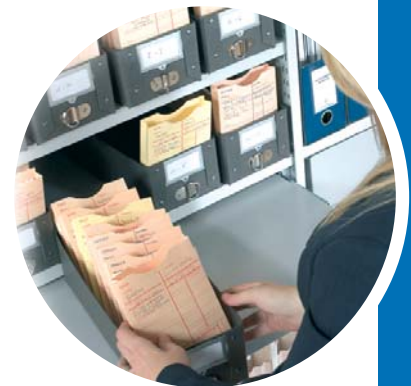
Lloyd George medical files are easily accommodated, offering easy access.