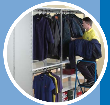
The easy interchangeability of accessories enables the user to tailor storage needs to meet his requirements