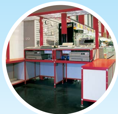
ANGLE AND SQUARE TUBE CONSTRUCTION SYSTEMS