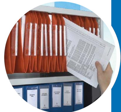
The design of the standard open shelf allows lateral files to be hung underneath, saving the cost of separate filing cradles.