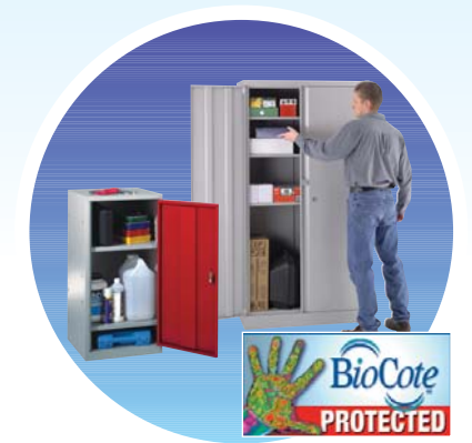
COMMERCIAL AND WORKPLACE EQUIPMENT