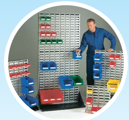
SMALL PARTS STORAGE