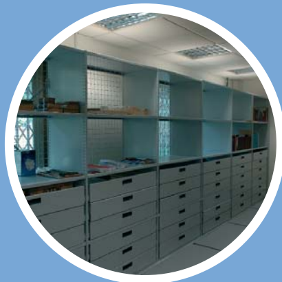
Stormor shelving helps create a more tidier and efficient stock storage solution