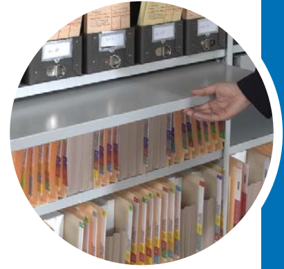
Pull-out reference shelves offer working space without obstructing walkways.

◀ Stormor Shelving is ideal for high density mobile shelving, making it the solution for commercial environments where space and costs are at a premium.