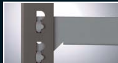
Dark Grey Uprights (GX) with Light Grey beams