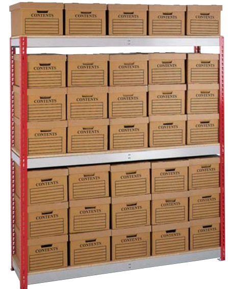
35 Box Unit