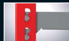
Red Uprights (RD) with Light Grey beams