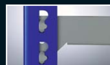
Blue Uprights (GB) with Light Grey beams