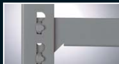
Light Grey Uprights (GU) with Light Grey beams