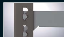
Dark Grey Uprights (GX) with Light Grey beams