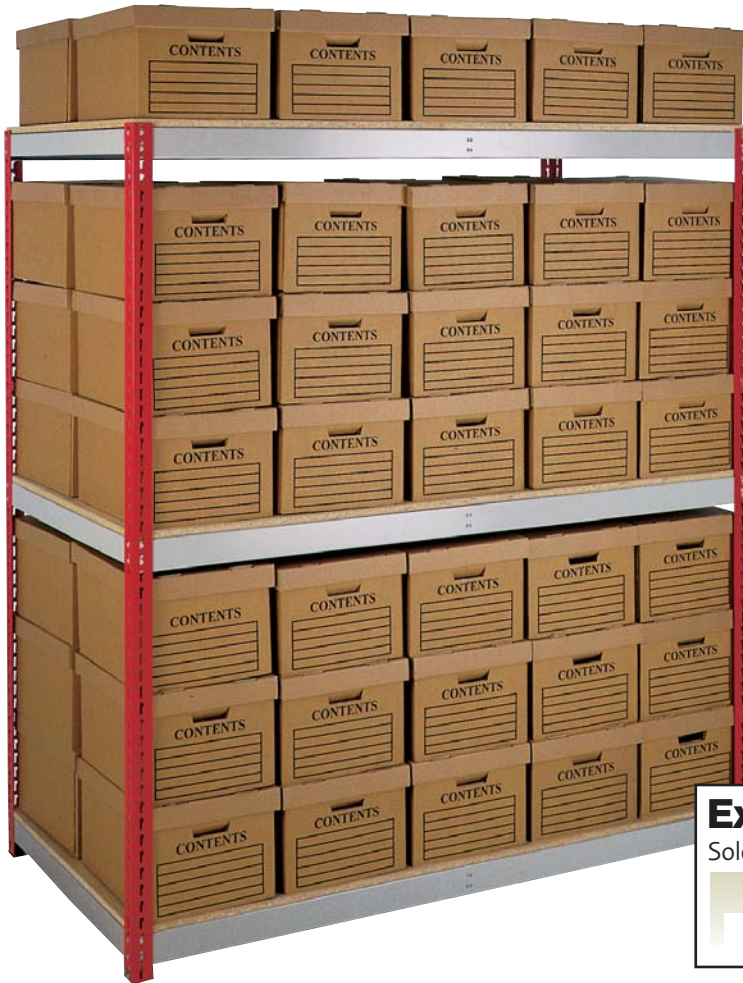
60 Box Unit (not pictured)

Boxes are: 266 h x 356 w x 445mm deep with internal dimensions of 254 h x 330 w x 407mm deep.