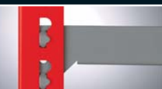
Red Uprights (RD) with Light Grey beams