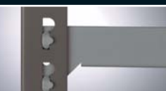
Dark Grey Uprights (GX) with Light Grey beams