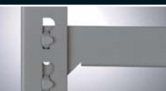
Light Grey Uprights (GU) with Light Grey beams

■ JUST WORKSTATIONS offer simple and economic solutions to the need of production assembly, maintenance and despatch personnel.