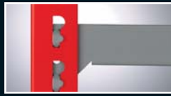
Red Uprights (RD) with Light Grey beams