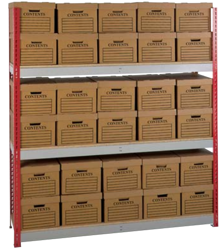
30 Box Unit