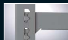
Light Grey Uprights (GU) with Light Grey beams